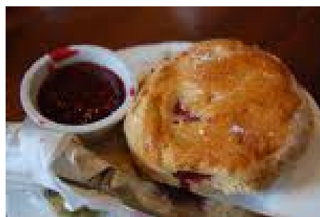
Buttered scones, complemented by local honey and preserves, provided a tasty treat at TTE's Food for Thought event